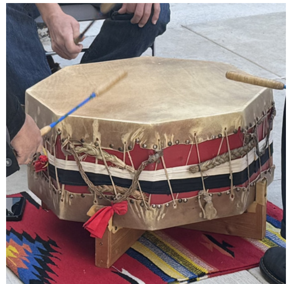
The drum cared for by Qalch'ema FriedLander's relative, that was used in the honor song presented during the event.